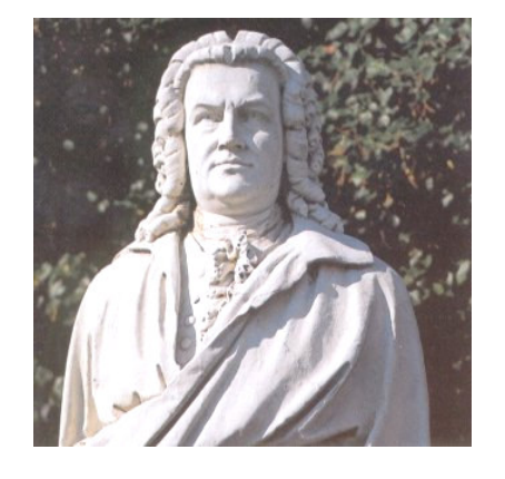
March 21, 1685 - July 28, 1750